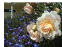
High Resolution with Virtual Pixel

Welcome to the next generation of visual experience - The Act One LED video display gives you the power to communicate, to motivate, and to entertain.