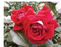
48-bit Dynamic Range Processing