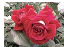
Conventional 24-bit Processing

The above four pictures shown are simulated and for the purpose of demonstrating the technology features only.